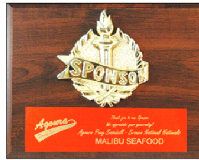
PL #6 $20.00 8x10 plaque for sponsor, coach, manager