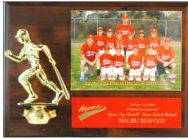
PL #2 - $39.00 9x12 plaque with gold sports figure mounted on pedestal