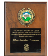
PL #7 $18.00 7x9 plaque