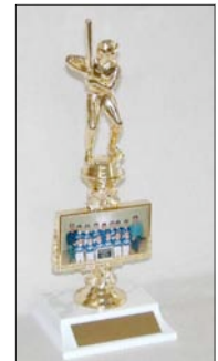
T #1 - $12.00 ((minimum order 12) TEAM PHOTO TROPHY includes engraving with players name & number! (Approx. 12" tall)