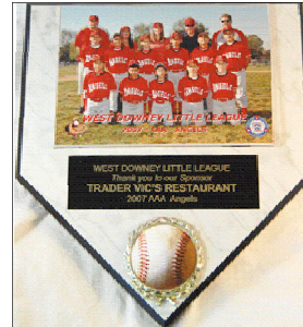
PL #10 - $35.00 Home plate- shaped plaque or your baseball or softball team!