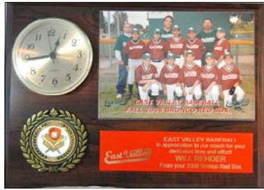
PL #1 - $45.00 9x12 plaque with quartz clock and sports logo encased in gold wreath

Use this handy form to order team picture appreciation plaques for your sponsors, coaches, managers, team parents and anyone else! Order on picture day and these beautiful plaques will be delivered with your finished picture packets. Plaques are custom laser engraved and designed with plexiglass covers to protect the team pictures.