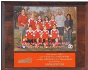
PL #4 $20.00 8x10 plaque