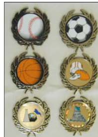
Medallions for each sport