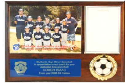
PL #3 - $39.00 9x12 Autograph Plaque All players sign this plaque!