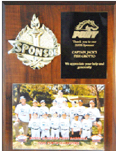
PL #8 - $30.00 9x12 plaque for sponsor, coach or manager