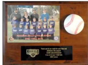
PL #5 $30.00 9x12 plaque with 3 dimensional 1/2 ball or helmet.